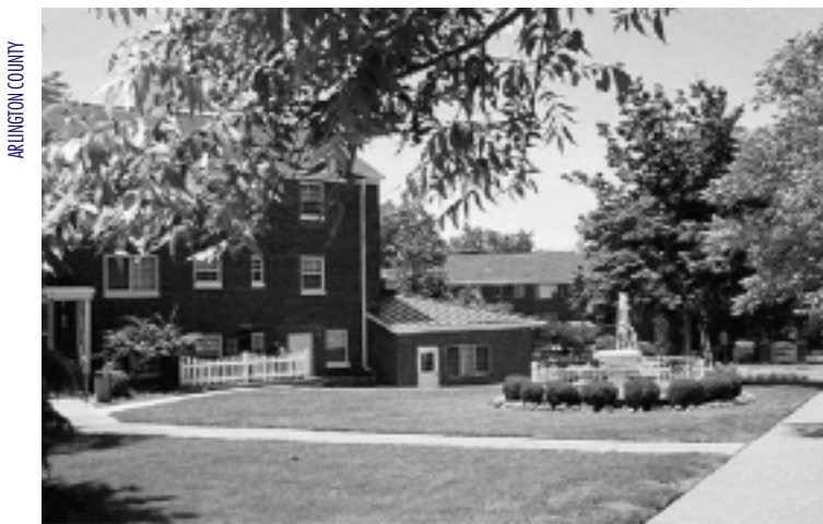
The Quebec Apartments were rehabilitated to provide 172 rental units, of which 129 apartments are committed affordable units.

For those site plan projects outside of the Metro corridors, residential projects must contribute $4.00 per square foot of above-grade gross floor area or $4,500 per unit, whichever is greater. And commercial projects are required to make a contribution of $4.00 per square foot of the total above-ground gross floor area.