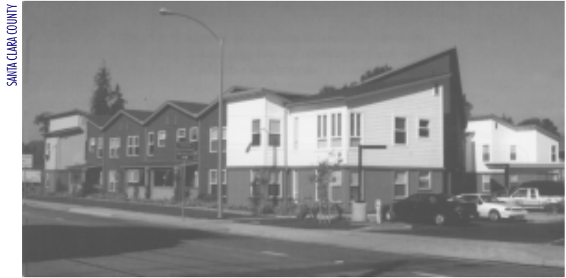
The Housing Trust of Santa Clara County has supported an array of housing financing programs. The Board of Supervisors has spearheaded the Fairgrounds revitalization project, which includes the development of hundreds of residential units.

The Local Housing Trust Fund Program defines a local housing trust fund as a public or joint public and private partnership created to receive on-going revenues for affordable housing production. Local revenues supporting the fund can include commercial impact fees, ongoing fundraising, or local taxes such as a Transient Occupancy Tax, as well as, local government general funds. State funding awarded to the trusts must be used for the development of affordable rental housing.