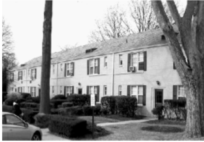
The Gates of Ballston is an apartment complex with 465 rental units which were rehabilitated and now include 349 committed affordable apartments.

The new Affordable Housing Guideline for Site Plan Projects permit more development than could generally be built by right under existing zoning regulations. Developers can gain higher density or greater building height as a trade-off for providing affordable housing units in their developments. The County will make funds available to enhance the affordable housing by providing deeper subsidy so that rents can be lowered or more family sized units produced.