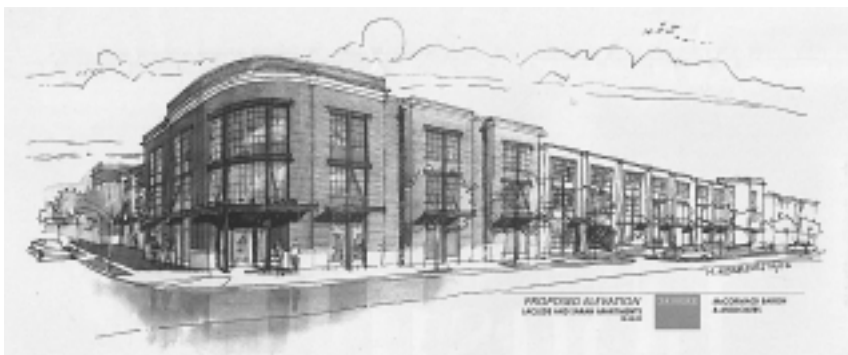
An architect's rendering of the Laclede and Sarah apartments. The development, sponsored by Urban Strategies, features 82 universally designed apartments.